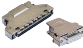
Connectors & Backshells

We provide a full range of supporting cable and connector solutions for all our switching products—20 connector families with 1200+ products. We offer everything from simple mating connectors to complex cables assemblies and terminal blocks. All assemblies are manufactured by Pickering and are guaranteed to mechanically and electrically mate to our modules.