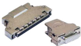
Connectors & Backshells

We provide a full range of supporting cable and connector solutions for all our switching products—20 connector families with 1200+ products. We offer everything from simple mating connectors to complex cables assemblies and terminal blocks. All assemblies are manufactured by Pickering and are guaranteed to mechanically and electrically mate to our modules.