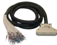
Multiwire Cable Assemblies