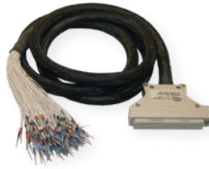
Multiway Cable Assemblies