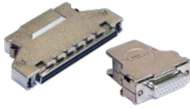
Connectors & Backshells

We provide a full range of supporting cable and connector solutions for all our switching products—20 connector families with 1200+ products. We offer everything from simple mating connectors to complex cables assemblies and terminal blocks. All assemblies are manufactured by Pickering and are guaranteed to mechanically and electrically mate to our modules.