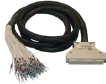
Multiway Cable Assemblies