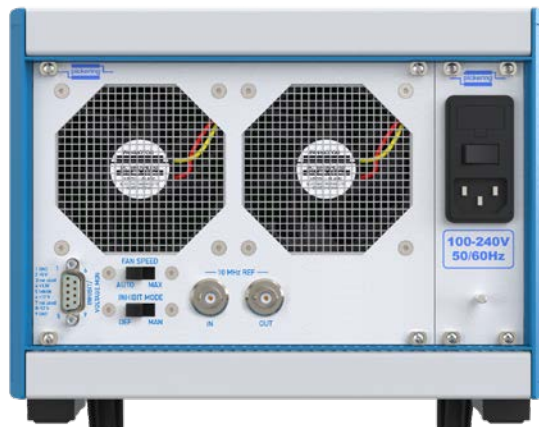
Rear of the 42-924 PXIe Chassis Showing Cooling Air Outlets, Reference Clock Connectors, Voltage Monitoring Port and Power Connector

Two 80mm fans insure maximum PXI module cooling and an efficient direct convection design allows the chassis to operate over an extended ambient temperature range of 0°C to +50°C.