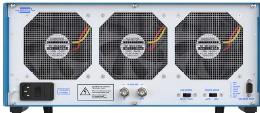
Rear of the 42-925 PXIe Chassis Showing Cooling Air Outlets, Reference Clock Connectors, Voltage Monitoring Port and Power Connector

Three 120 mm fans insure maximum PXI module cooling and an efficient direct convection design allows the chassis to operate over an extended ambient temperature range of 0°C to +50°C.